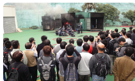
Visit to Fire Services Training School

Application Fee (HK $160) waiver for on-site programme application